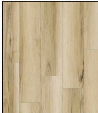
Hickory Knob (WE-203)