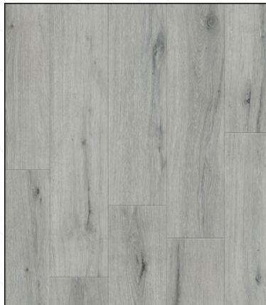
Cottonwood Trail (WE-202)