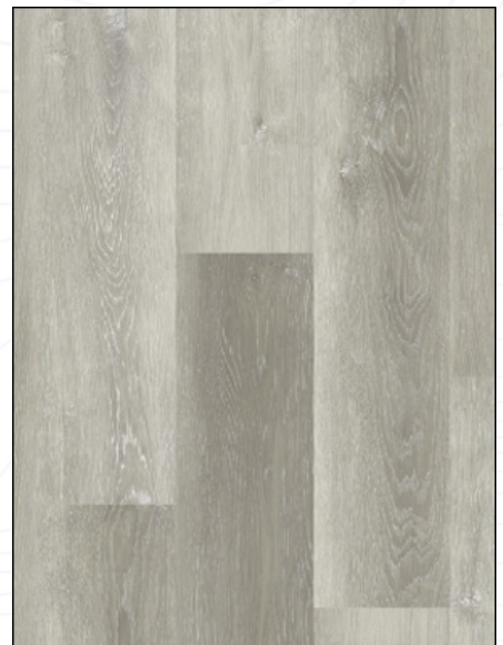
Mist Ash (WP-111)