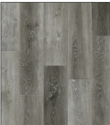
Smoked Oak (WE-204)